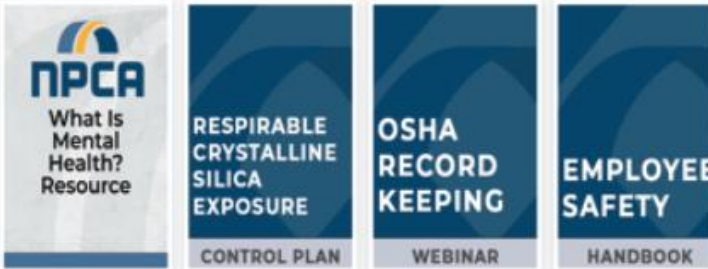
What Is Mental Health? Resource Exposure Control Plan for Respirable Crystalline Silica OSHA Record Keeping Webinar Employee Safety Handbook