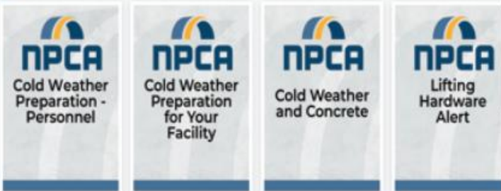
Cold Weather Preparation - Personnel Cold Weather and Your Facility Cold Weather and Concrete Lifting Hardware Alert