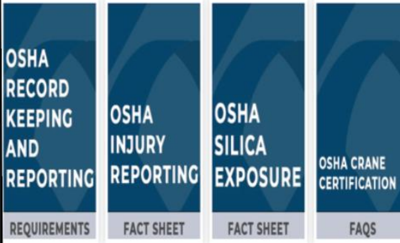
OSHA Record Keeping and Reporting Requirements OSHA Electronic Injury Reporting Fact Sheet OSHA Silica Exposure Fact Sheet OSHA Crane Certification FAQs

OSHA regulations play a major role in the precast concrete industry.