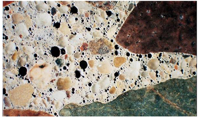
Microscopic photo of concrete showing air bubbles.

Today's air-entraining admixtures are primarily liquids produced from byproducts of wood resins. However,