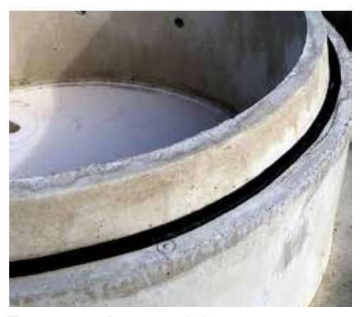
Tongue and groove joint

This joint design started making its appearance in the early 1990's. It quickly became popular for vertical manhole installations and is considered a cleaner, more user-friendly application because it requires less lubrication than an O-ring joint. There are many different shapes and styles of profile gaskets available including pre-lubricated closed-cell gaskets that allow for a completely lube free installation.