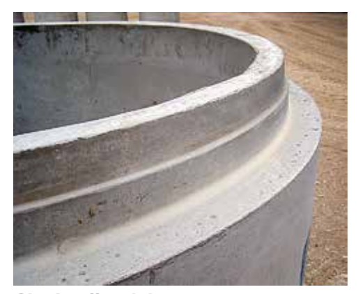
Single offset joint