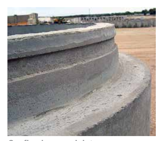
Confined groove joint