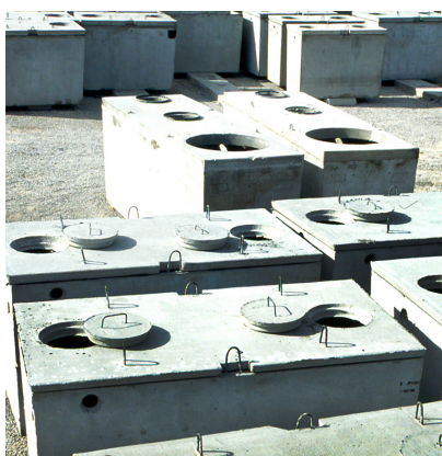
On-site Wastewater Tanks